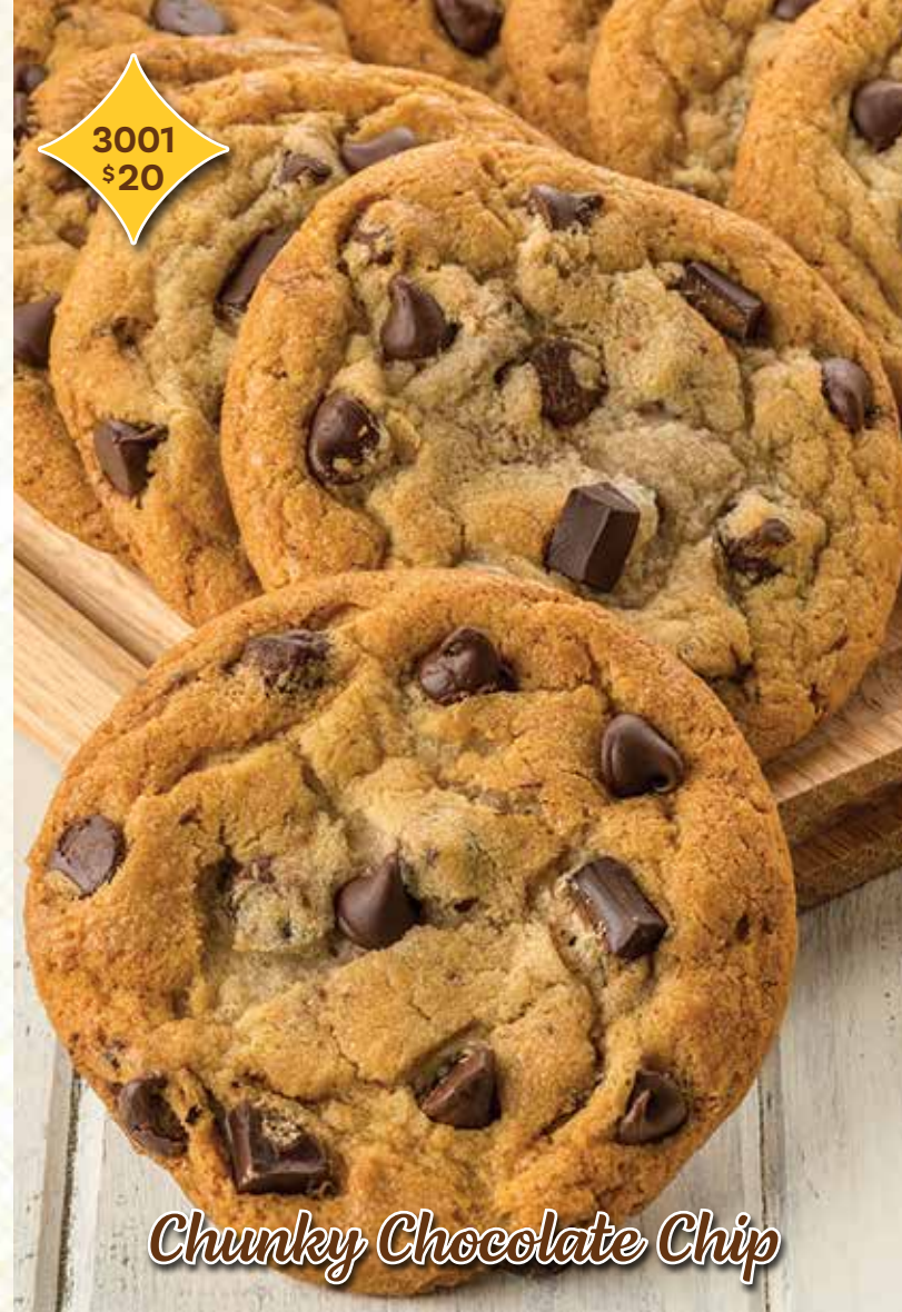
Shelf Life: frozen 1 year; refrigerated 6 months; room temperature (66°-77°F): 21 days.